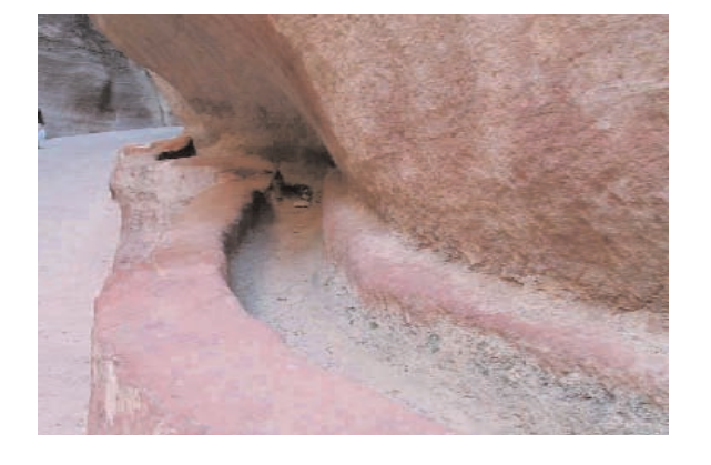
JORDAN, Petra. Water channels uncovered during the excavation of the Siq as part of rehabilitation of the Siq to its original Nabatean status.