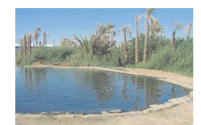
EGYPT, Siwa. Water cistern fed by subterranear ground water (Roman).