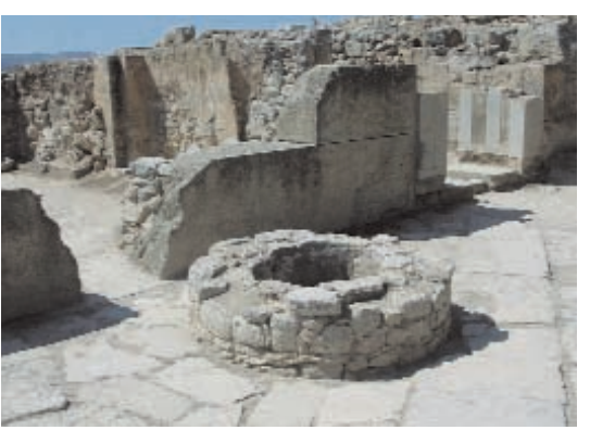
GREECE, Crete. Ancient water caption stone basin, palatial period.

As consequence of this, the reuse of the traditional water systems is both a fundamental contribution to the water resource management based on the local sustainability and the recovery of aesthetical values of the monuments which are a further resource for people. Case studies the Consortium focused on are the leading examples for a methodology which could be suitable also in other environments.