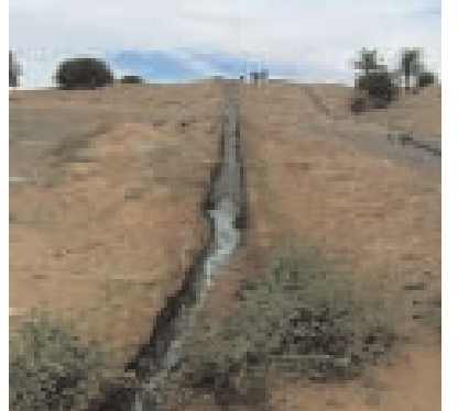
ALGERIA, Adrar. Foggara.