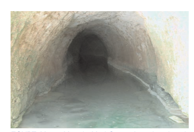
EGYPT, Marsa Matruh, Med Coast. Aqueduct: beach Foggara.